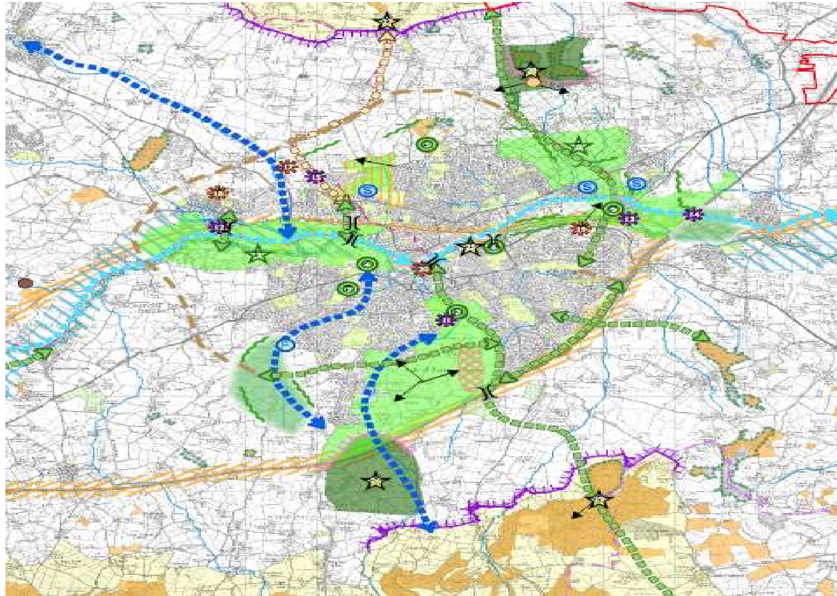
Taunton Deane Green Infrastructure Strategy Figure 4.1: Strategic GI Opportunities Map