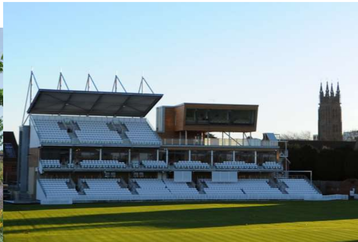
New stand at The County Ground