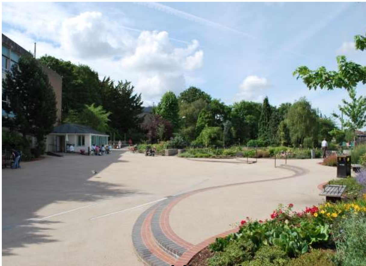
New public realm