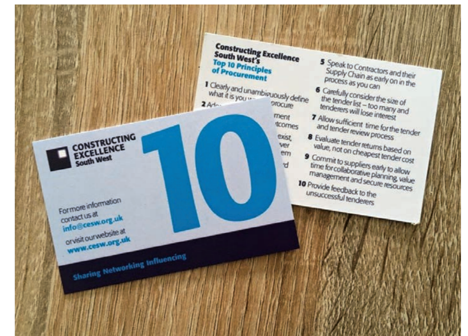
The Procurement Forum's Top 10 Principles of Procurement