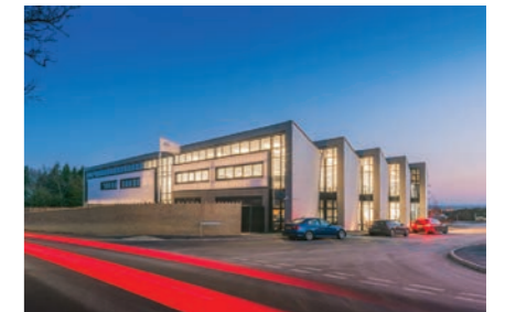
Project of the Year SRA Architects for AB Dynamics