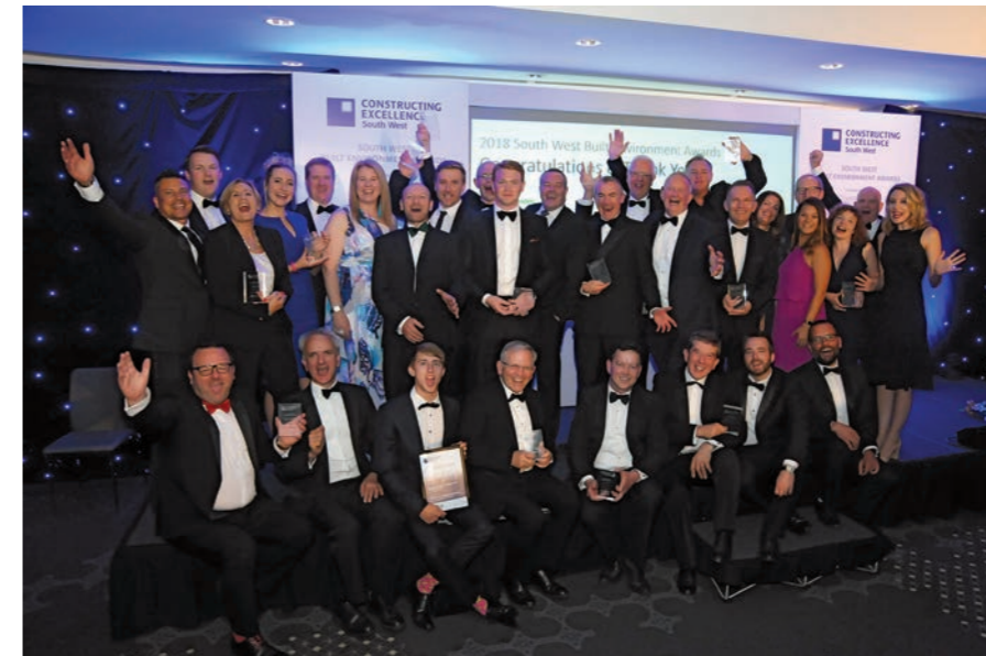
All the Winners

Winner of Winners: EDF Energy for Hinkley Point C