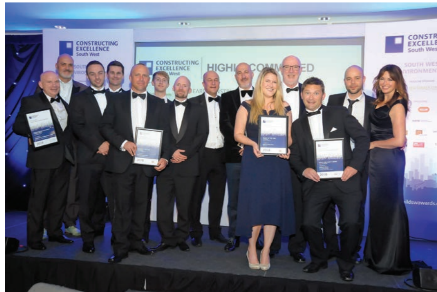
Highly Recommended Finalists at the Awards with Suzi Perry